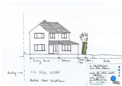
Proposal after contacting Prospero Planning

Prospero Planning discussed the Council's concerns about the proposal directly with the case officer and reviewed the policy documents referred to as well as using their experience of working for Local Planning Authorities. Working with the client and a new architect, we were able to advise on a scheme that would be acceptable. We prepared, submitted and managed a new planning application on behalf of our clients, and received planning permission within 8 weeks with no further amendments required. Here's what our client had to say when planning permission was granted: